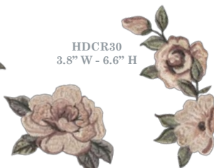
HDCR30 3.8" W - 6.6" H