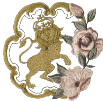
HDCR34B 4.8" W - 4.8" H