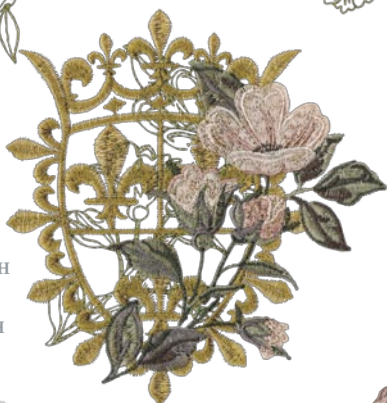
HDCR6 5.8" W - 6.3" H