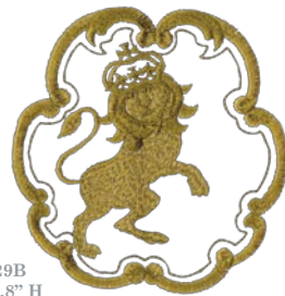
HDCR29B 5.8" W - 5.8" H