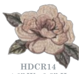
HDCR14 4.8" W - 3.5" H