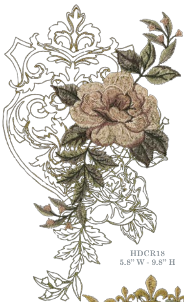
HDCR18 5.8" W - 9.8" H

13 Jumbo Designs Not all designs shown here