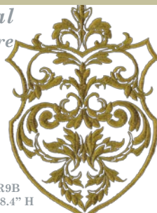
HDCR9B 5.8" W - 8.4" H

19 Crest Designs Total Not all designs shown here