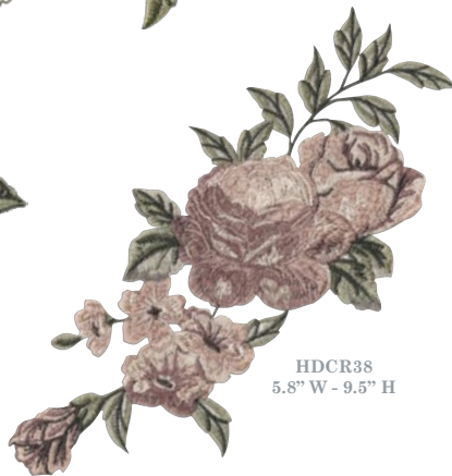
HDCR38 5.8" W - 9.5" H