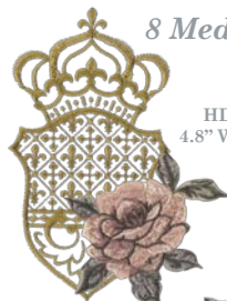
HDCR26 4.8" W - 6.4" H