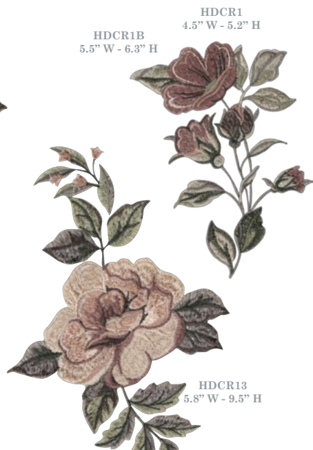
HDCR1 4.5" W - 5.2" H