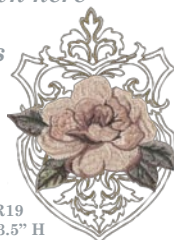
HDCR19 4.8" W - 3.5" H