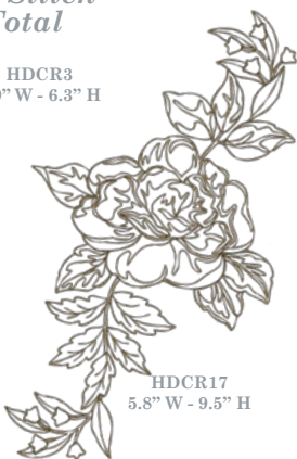
HDCR17 5.8" W - 9.5" H