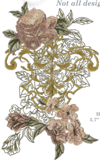
HDCR43 5.7" W - 9.0" H