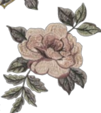
HDCR13B 4.8" W - 6.8" H