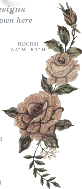
HDCR21 5.5" W - 9.7" H